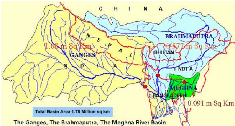
Fig. 1 The Ganges–Brahmaputra–Meghna (GBM) basin. Bangladesh represents the lowermost riparian nation comprising 7% of total basin area. Circles in red indicate the major boundary conditions for current river flow monitoring

128 or early reaping of crops, while a 21-day forecast is considered most ideal [Asian 129 Disaster Preparedness Center (ADPC), 2002]. Extended forecasts also assist in 130 economic decision-making for developing countries through early disbursement of 131 rehabilitative loans to regions anticipated to be affected by floods (Ninno et al. 132 2001).